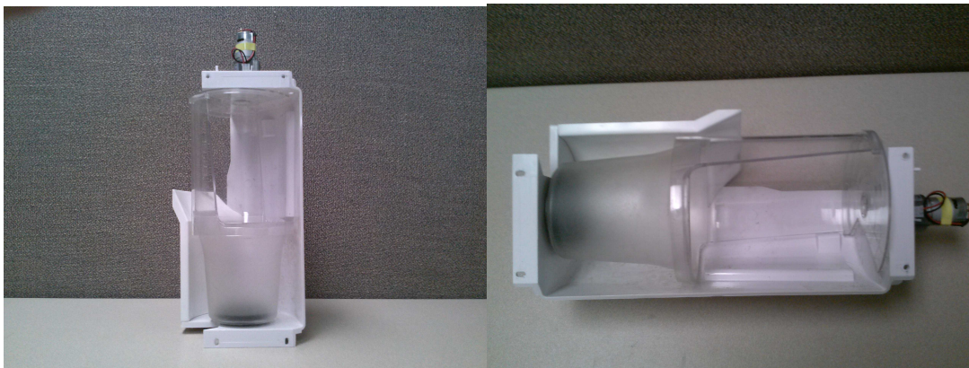
Figure 1 CR0015405