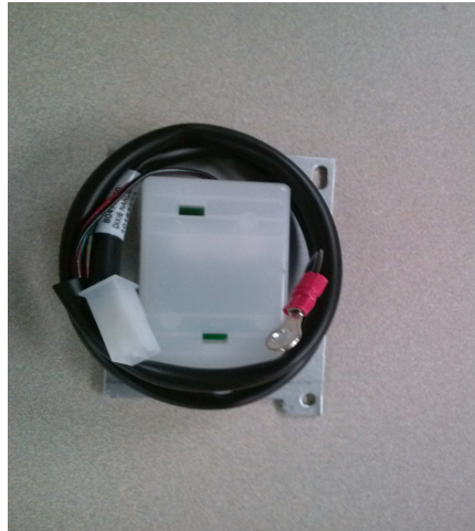
Figure 2 CR0003022